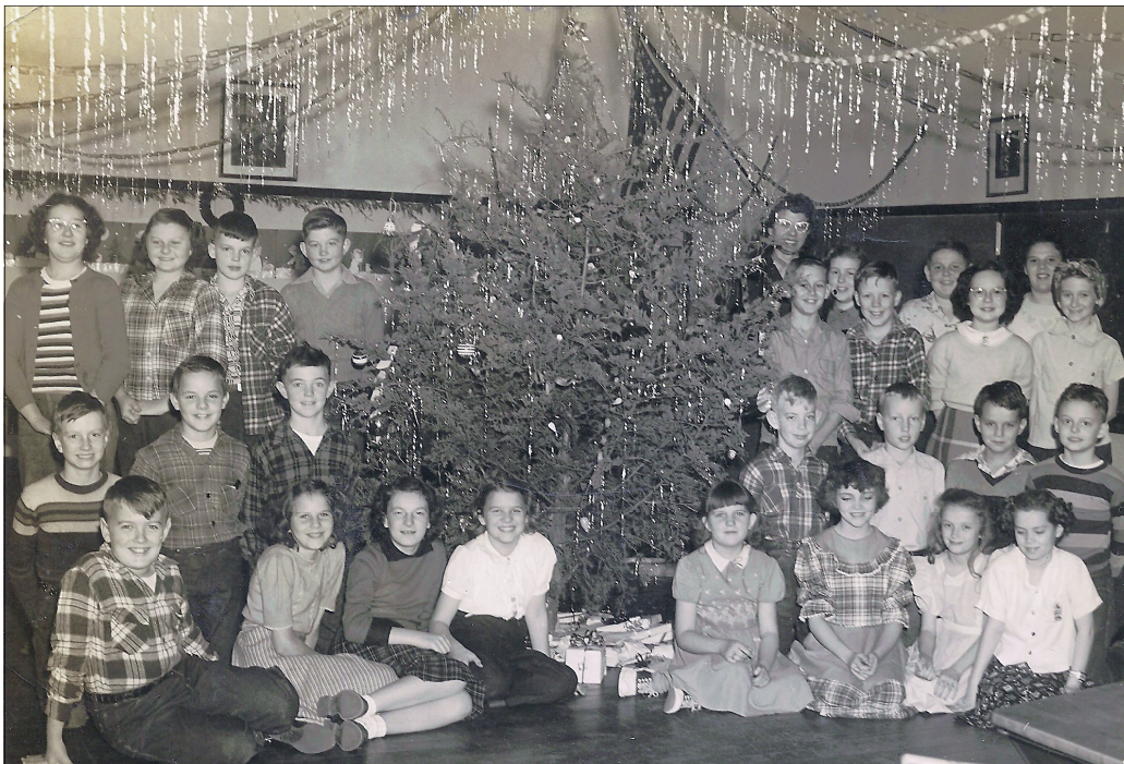
Central School 1949-1950