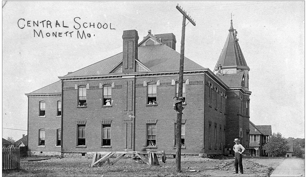
Central School—Monett, Missouri